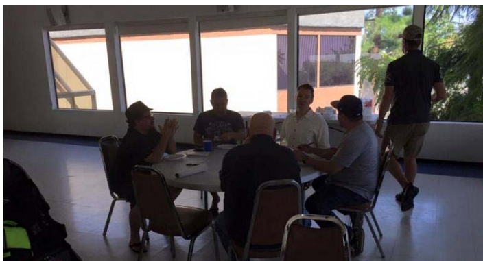
There was some chili judging going on in August, hope everybody survived.

To the Family of the Lodge Member to whom this newsletter is addressed: Please notify us if our member is in a hospital or nursing home or is incapacitated in any way. Thank you